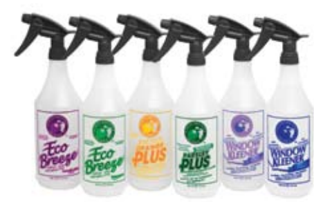
Silk-screened bottles available.

We use standard-sized, recyclable containers. In addition to our #1 PETE trigger spray and squeeze bottles, we use #2 HDPE recyclable plastic gallons, deltangulars*, pails & 55 gallon drums. Silk-screened bottles are available.