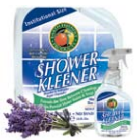
Shower Kleener™ Light-Duty Cleaner and Surface Shield

Shower Kleener is two products in one - it's a light-duty cleaner for shiny surfaces and it creates a protective shield that prevents the build-up of mineral deposits and soap residue. Made with a corn derivative, lavender oil and tea tree oil, it is ideal for glass, ceramic shower doors, walls, wood and most flooring, sinks, counters and mirrors. Leaves surfaces shiny, tack-free, and protected.